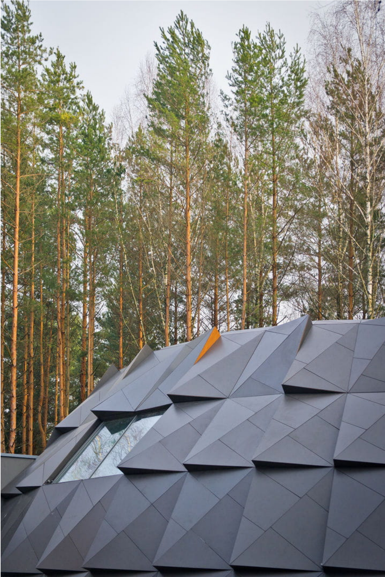
SPA Vilnius Anykščiai wellness and relaxation center