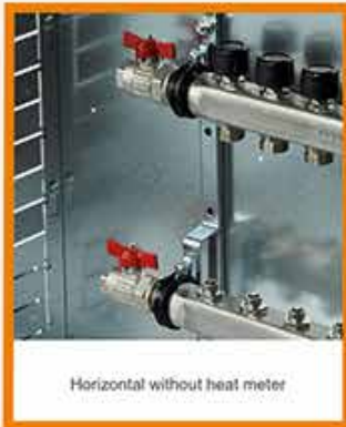
Horizontal without heat meter