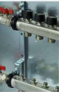
Horizontal without heat meter