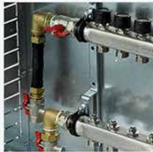
Vertical with heat meter