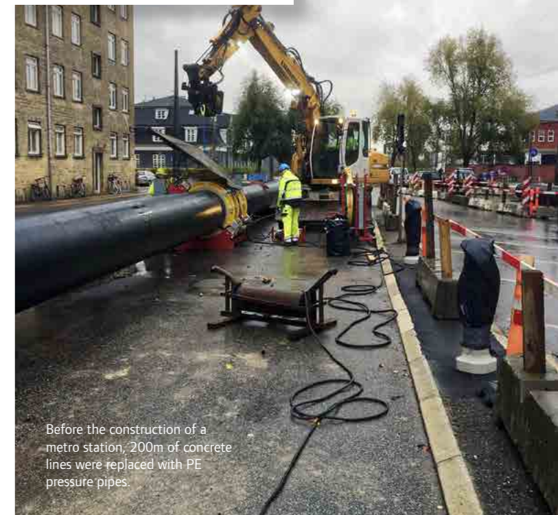
Before the construction of a metro station, 200m of concrete lines were replaced with PE pressure pipes.