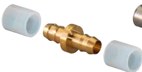
Q & E coupling

At Uponor, we see nature as an ingenious design engineer since it is capable of creating perfect structures which are able to withstand mechanical stress using minimum raw materials and energy. Even the smallest details are eliminated or perfected by evolution.