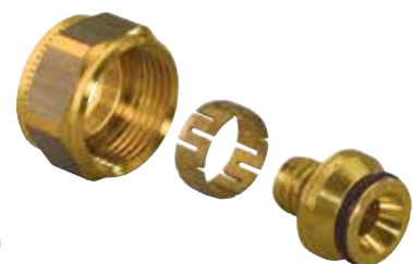
Vario compression fitting