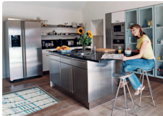
Great heat and comfort even across large rooms: with the Uponor Classic system, you can ensure a uniform indoor climate in rooms of virtually any size and shape.

Available in three raster sizes, Uponor Classic allows you to optimise the pipe spacing to meet the actual heating needs. As the heating layer is separated from the insulation layer(s), the system, in combination with high-payload insulation, is also ideally suited for areas with high traffic and payload, such as garage showrooms, production halls, retail outlets, etc.