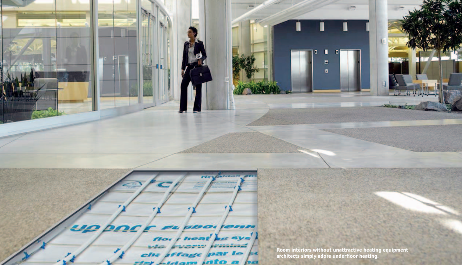
Room interiors without unattractive heating equipment - architects simply adore underfloor heating.