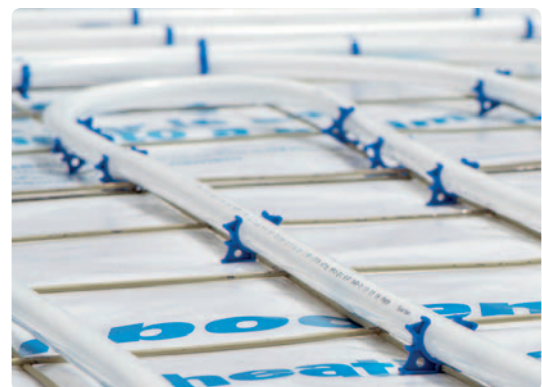
Bending radius = 8.5 cm (17 x 2 mm)