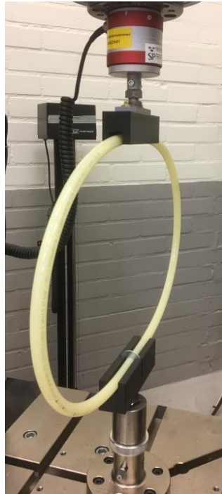
Figure 1 Generic picture of flexibility testing.