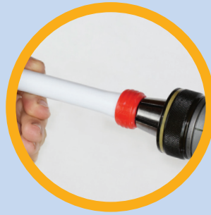
Q&E Shrink Fit