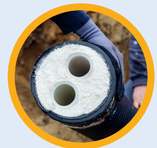
Ecoflex Thermo Pro