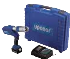
Uponor S-Press tool UP110