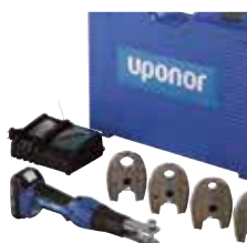
Uponor S-Press tool Mini2