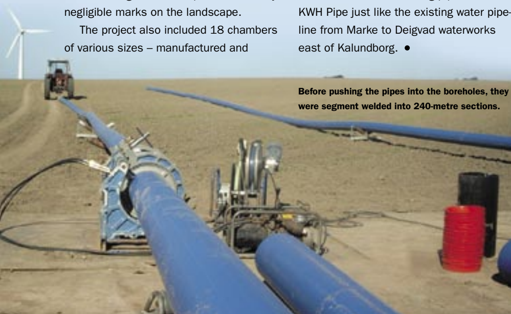
Before pushing the pipes into the boreholes, they were segment welded into 240-metre sections.

The new water pipeline from Langerød waterworks was built using pipes from KWH Pipe just like the existing water pipeline from Marke to Deigvad waterworks east of Kalundborg. ●