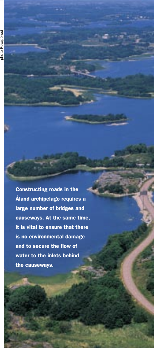
Constructing roads in the Åland archipelago requires a large number of bridges and causeways. At the same time, it is vital to ensure that there is no environmental damage and to secure the flow of water to the inlets behind the causeways.