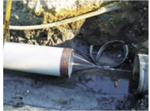
The new pipes were inserted into the old ones in three stages. Each individual pipe had a length of 18 metres.