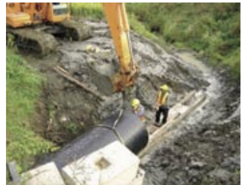
The culvert was sliplined with DN/ID 96 inch (approximately 2.4 m) Weholite. With a small work force of only four men, the team completed the project in record time.