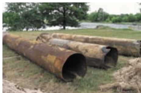
Massive corrosion was detected in the older steel pipes after only a few years of operation.

According to the investor, renovation with PE pipes turned out to be less expensive than pro-