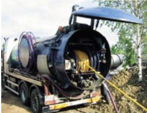
The pipes were pulled into place using a winch truck and a hydraulic ram.