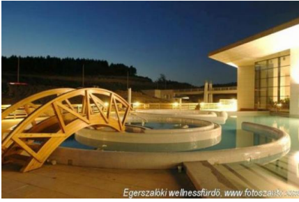
Egerszalóki wellnessfürdő