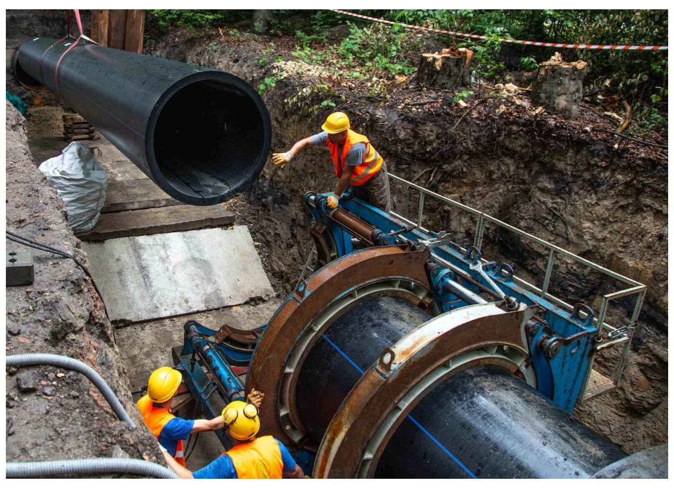
Renovation of a water supply system in an area with mining damage