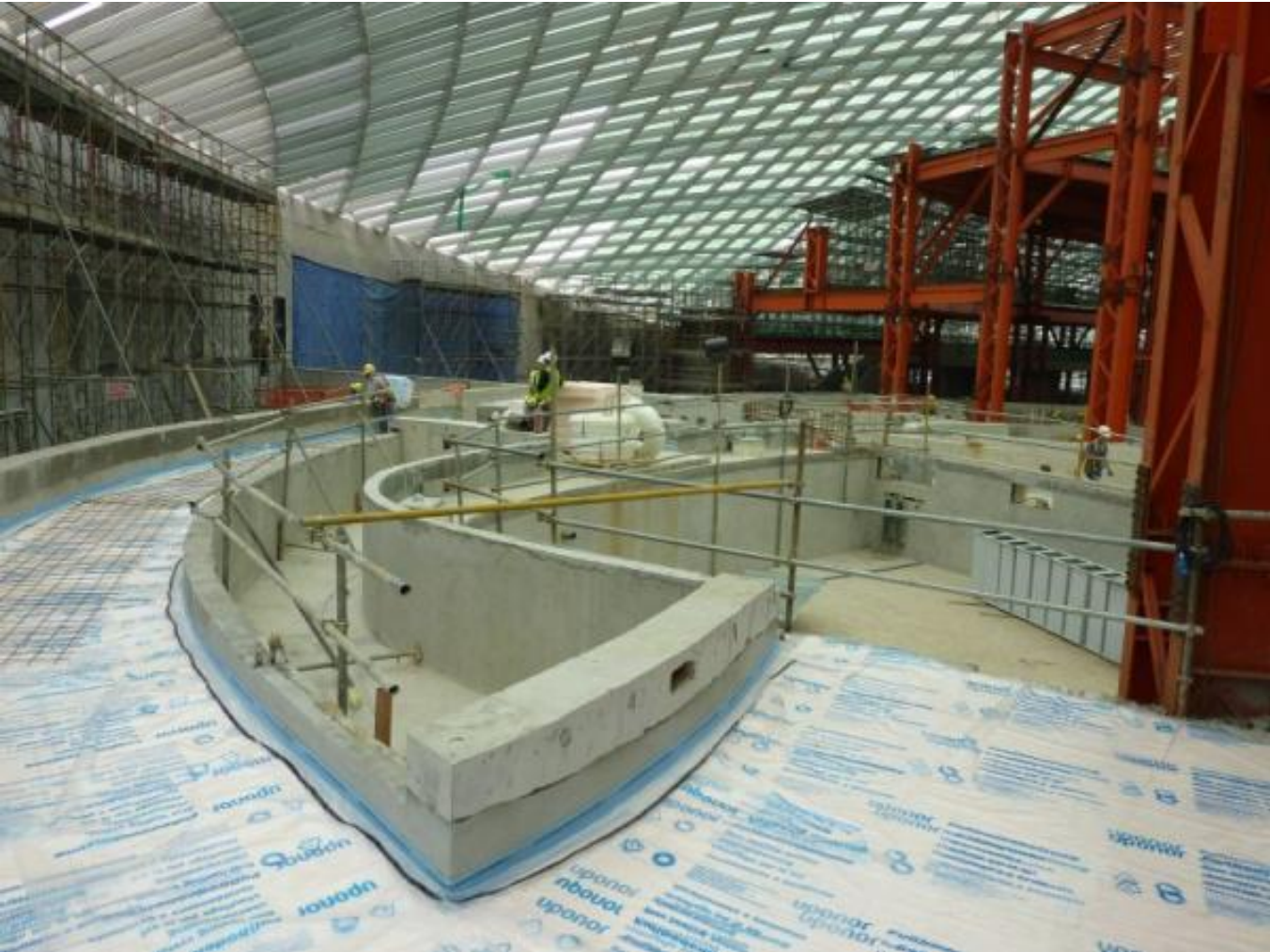
Gardens by the Bay, Singapore