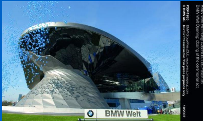
BMW Welt Eröffnung: Abschluss des Festivals. BMW Welt Opening: closing of the seasonal fest. © BMW AG. BMW Group PressCL: www.press.bmwgroup.com BMW AG. New for Press: www.press.bmwgroup.com 10/2007